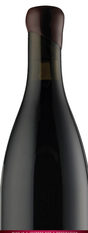
CUSHING'S BLOCK Pinot Noir

~23% Whole Cluster · Native Ferment/Native ML